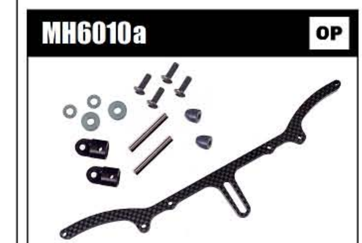
MH6010a REAR BODY MOUNT SET