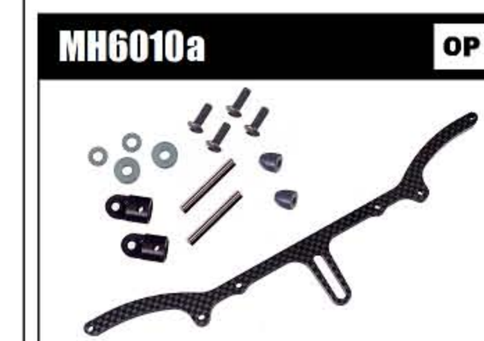
MH6010a REAR BODY MOUNT SET